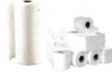
Tissues & Paper Towels