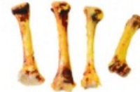
Meat Scraps, Fish & Bones