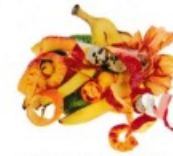
Fruit & Vegetable Scraps