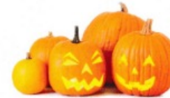
Pumpkins (broken into pieces)